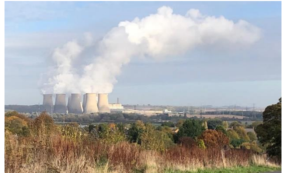
1 Ratcliffe Power Station to close in 2025